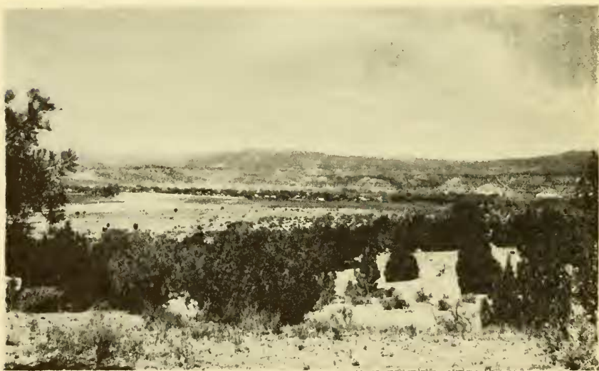
Figure 9. Pinyons and Junipers at Escalante, Utah. The Escalante River in the background is lined with cottonwoods, Populus fremontii .

Matchweed, Gutierrezia spp., 5 per cent; Brigham tea, Ephedra torreyana , 2 per cent and Prickley pear, Opuntia rhodantha , 2 per cent. It was also noted that there is considerable variation between Coleogyne and Krameria , with respect to their dominants. In Figure 5 the light areas are 70 to 80 per cent Krameria while in the dark areas are 70 to 80 per cent Coleogyne . This may be due to a number of factors such as, soil and water, either one or both. In Figure 7 in the right hand side Ephedra is shown serving as a sand binder, while the plant in the light foreground is mainly Krameria and the dark plant extending back to the chimney rock is Coleogyne .